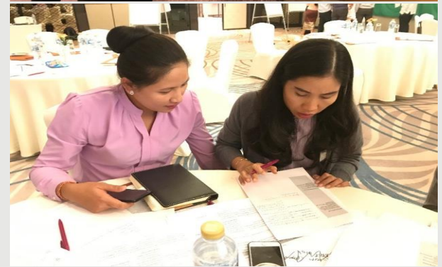
Top: Participants in the stakeholder workshop identify, categorize, and assess risks to the Lao power sector