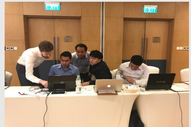
Top: DWG delegates at SEI headquarters in USA